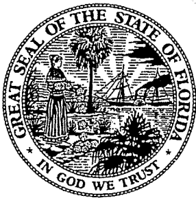
Cord Byrd Secretary of State

Given under my hand and the Great Seal of the State of Florida at Tallahassee, the Capital, this the Twentieth day of May, 2025