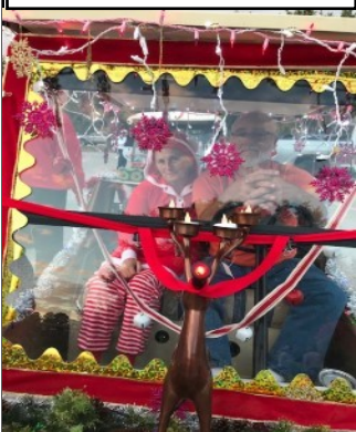
GOLF CART PARADE 2019