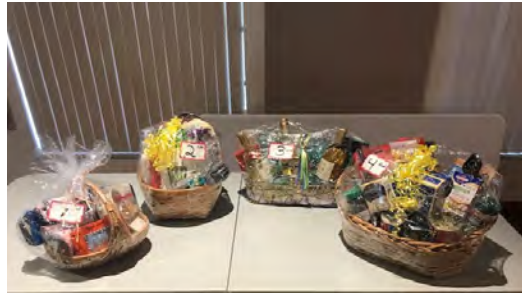
Beautiful Baskets for the Raffle