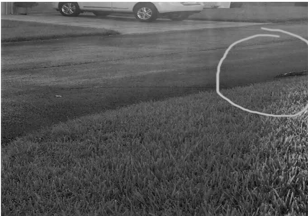
SMALL ALLIGATOR ON TOLAR DR

To enroll, see the See page 7 for the Owner Profile form