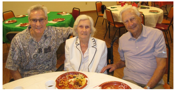
Oh what fun.....!!!